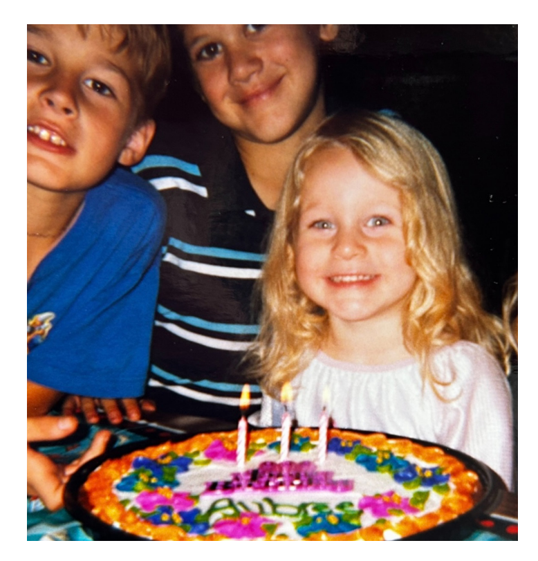
"Yoy're helping the little girl in me achieve things I never thought I could."